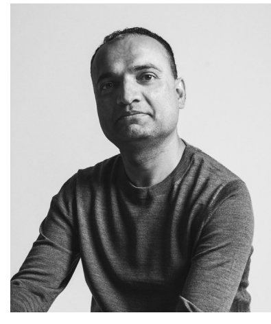
Chief Sustainability Officer Member of the Management Team since 2021 b. 1976, Doctor of Science (Tech) Bangladeshi and Finnish citizen Company shareholding on 31 December 2022: O shares and 3 000 Options 2018, 55 000 of 2022 A3 options amd 55 000 of 2022 B3 options (2018: one option equals 30 shares, 2022 A3 and B3: one option equals one share)